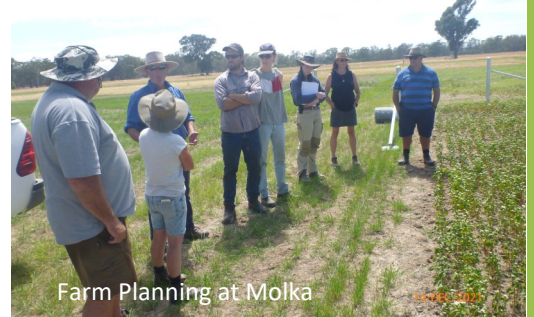
Farm Planning at Molka