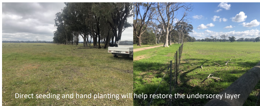
Direct seeding and hand planting will help restore the undersorey layer

By adding in the understorey (shrub) layer through a combination of direct seeding and hand planting, the natural bush is being restored. This along with allowing leaf litter and fallen timber to build up will allow bugs, spiders, insects a place to live and will provide ideal habitat for birds and particularly the small ones.